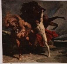
Henri Regnault, Automedon with Horses of Achilles 1868

Regnault, (1843-1871), This Romanticist painting illustrates a story from Homer's Iliad. Automedon, chariot driver for the Greek warrior Achilles, restrains the horses Xanthos (behind) and Baliou, two beasts who could predict the future. As Regnault wrote, "the horses, aware that their master [Achilles] is taking them into combat, and that this combat will be the last and will cost him his life, struggle and wrest with the groom who has come to take them from their pasture. One of them, chestnut brown, rears like a great dark phantom, outlining himself against the sky. I wanted to give the picture a foretaste of disaster."