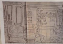
Picasso (1881-1973) Solon of Villa Beauregard, c.1920 Interior at often made drawings to inform his paintings and sculptures, feeling that these drawings should be quick, general exercises that captured the form and emotion evoked in him by the subject. As the most direct expression of the artist's thoughts, drawing often helped Picasso to work out compositional and stylistic problems or new ideas.