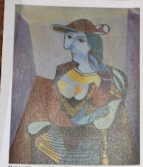
Pablo Picasso, Mao Thérèse 1937

Picasso (1881-1973), did numerous paintings of women including lovers as in this case - Mao Thérèse. This later cubist phase is a colorful rearrangement of parts and distortion to convey intensity of feeling. After Cubism he explored many other means of expression in other media such as collage, sculpture and ceramics. It is estimated that Picasso's lifetime output is over 20,000 works.